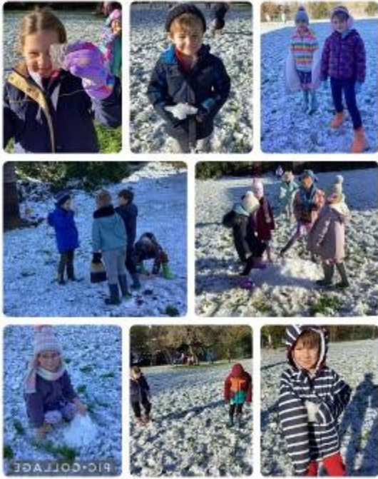
Year 2 - Enjoying the snow on Friday