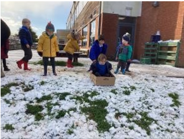
Reception children having great fun!

Everyone that made it in to school on Friday had a great time playing in the snow.