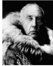
Roald Amundsen –Explorer