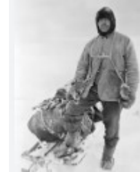
Robert Falcon Scott—Explorer